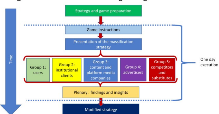
Figure 2. Bienestando's wargaming structure